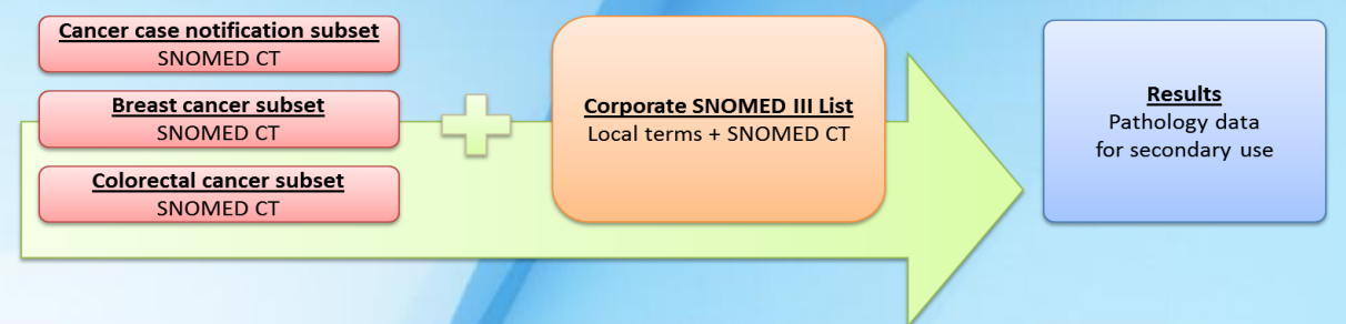
Fig 2. Example of using different SNOMED CT subsets for pathology data retrieval.

The poly-hierarchy structure of SNOMED CT provides knowledge for data analysis and quality assurance. e.g. To check if retrieved terms are definite malignant with SNOMED CT subsumption testing. Hence, accurate data can provided to improve health care services.